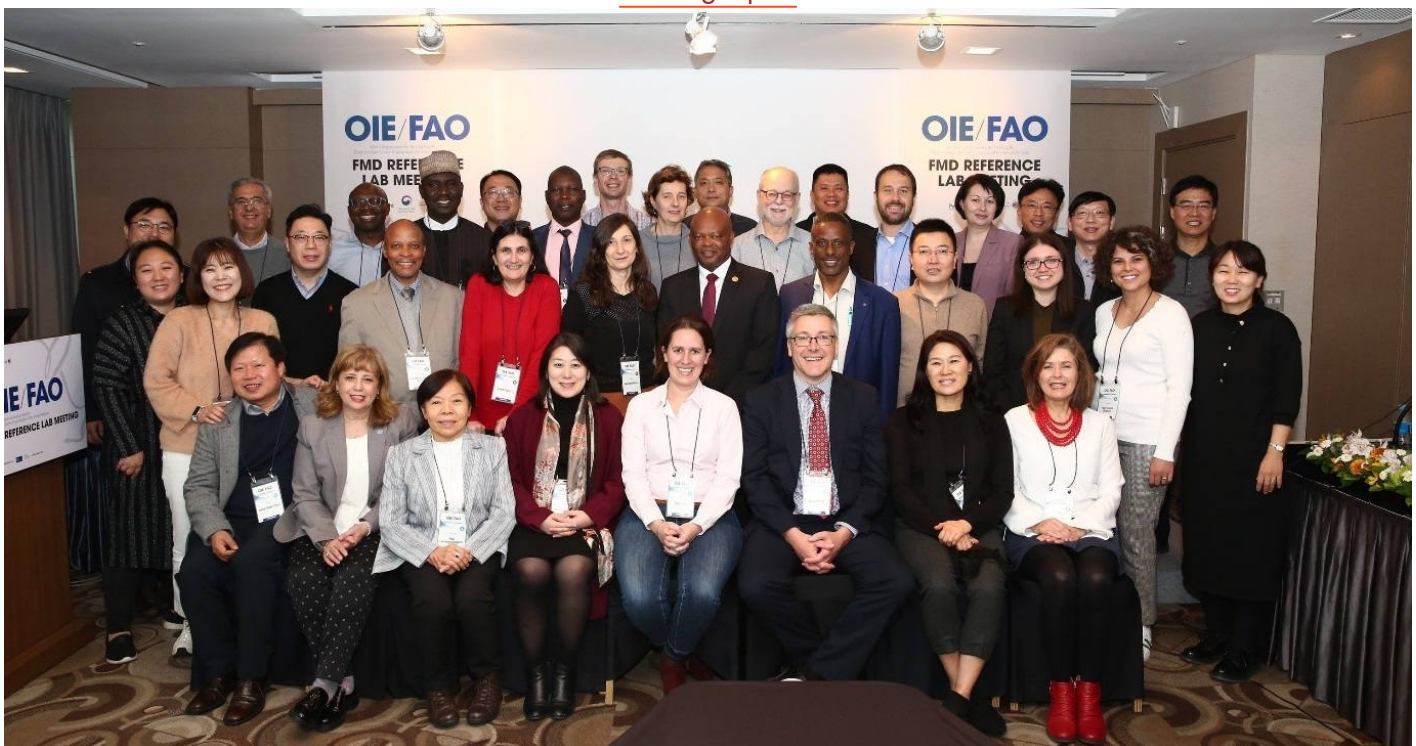
The meeting was kindly hosted by the Animal and Plant Quarantine Agency (APQA)