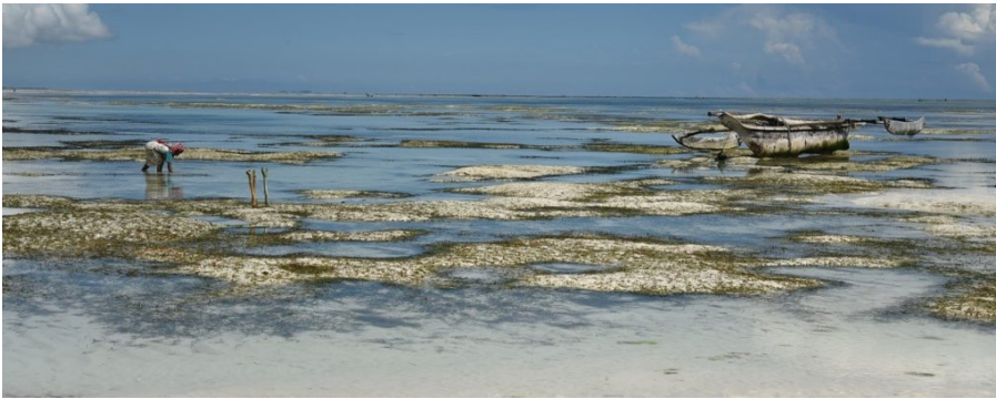
All pollution ends up in the marine environment.

#antimicrobial resistance (AMR), #environmental impact, #Interagency Coordination Group (IACG), #World Organisation for Animal Health (WOAH).