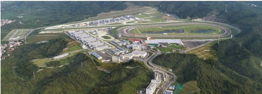
Conghua's EDFZ, partial view.

The views expressed in this article are solely the responsibility of the author(s). The mention of specific companies or products of manufacturers, whether or not these have been patented, does not imply that these have been endorsed or recommended by the OIE in preference to others of a similar nature that are not mentioned.