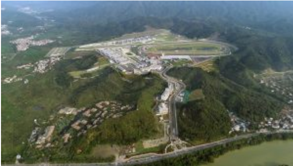
Conghua's EDFZ.

Understanding the movements of animals and animal products and being able to control them efficiently are essential to effective biosecurity. The movements of domestic equids, other animals and biological materials are only allowed into the EDFZ by permit and are subject to quarantine requirements. Quarantine requirements for Hong Kong racehorses travelling across the border have been jointly defined by the Hong Kong Agriculture, Fisheries and Conservation Department and mainland authorities, including the PRC Customs Department and Ministry of Agriculture and Rural Affairs. Signage, three quarantine checkpoint controls and random monitoring to prevent unauthorised entry into the core zone support these requirements.