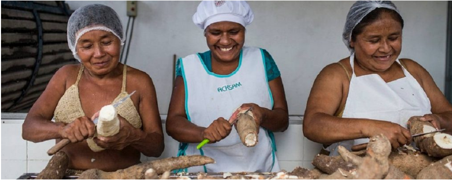
Kirirí indigenous community of Marcação, Brazil.