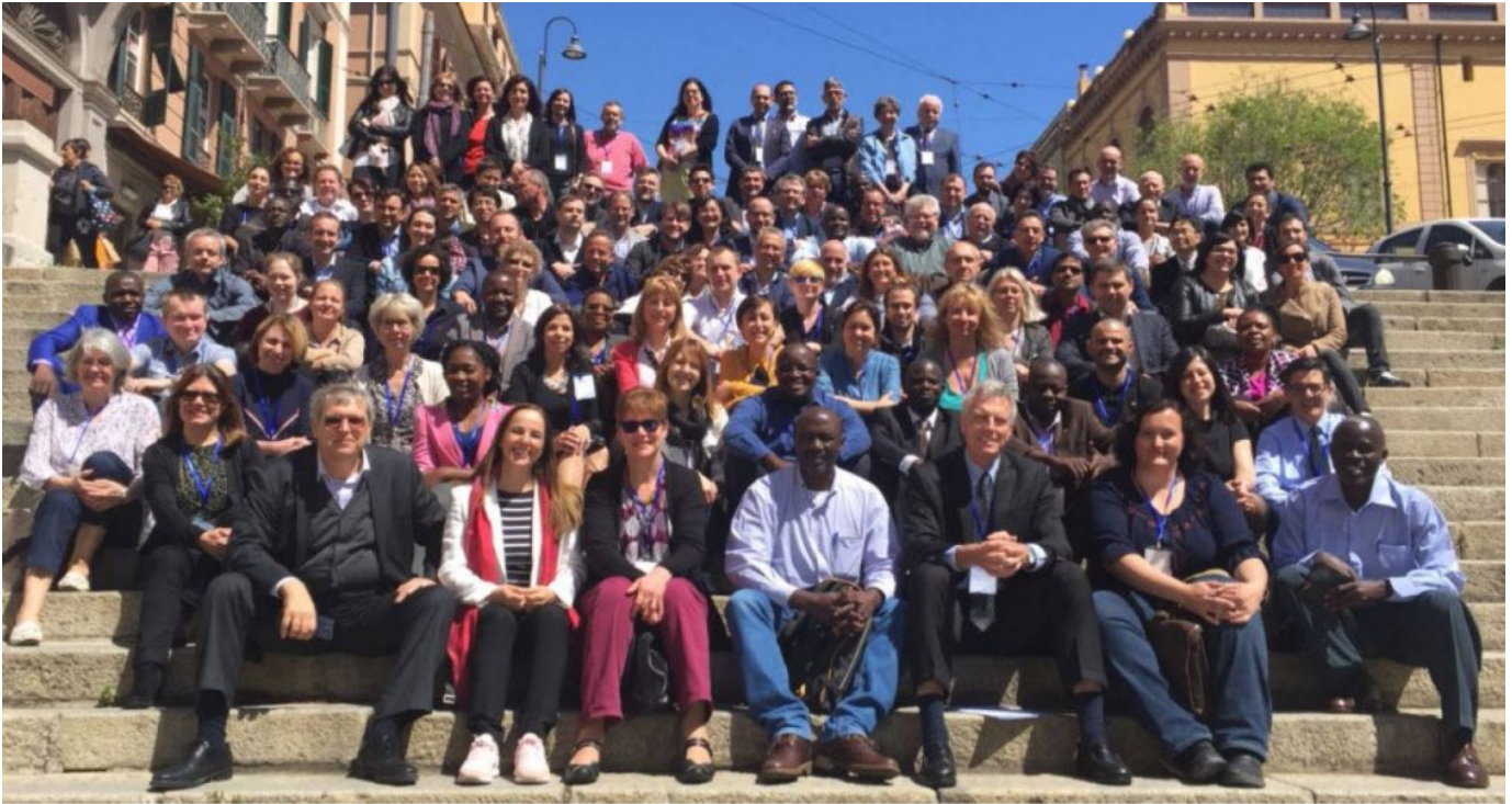
ference, Istituto Zooprofilattico Sperimentale, Cagliari, Sardinia, Italy, 11–13 April 2018

Today, GARA consists of 38 partner research institutions working together to fight the threat of ASF. The Alliance maintains the GARA website to facilitate communication and provide technical information. One of GARA's most important initiatives is the series of biennial ASF Gap Analysis workshops it organises; for example, an ASF Gap Analysis Workshop in Sardinia, Italy, April 2018.