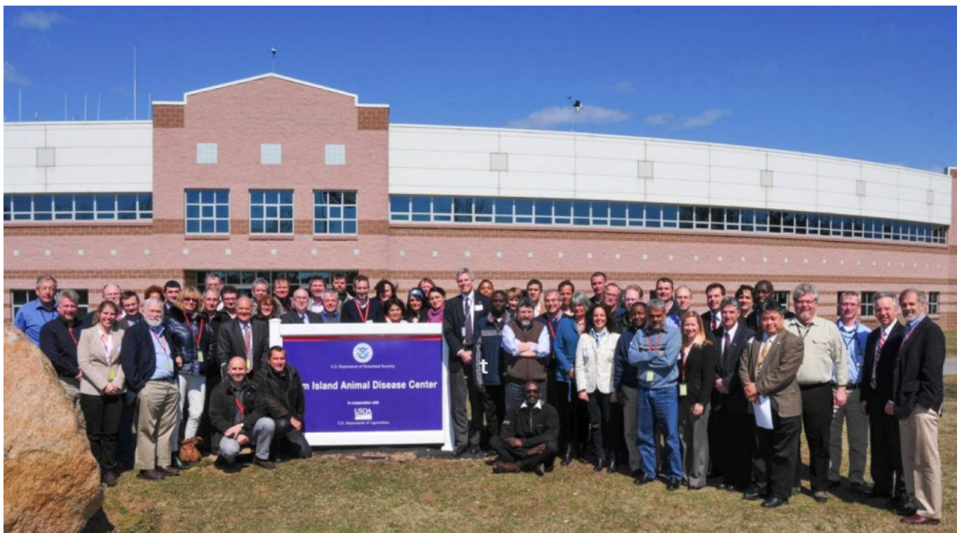
Conference, Plum Island Animal Disease Center, Orient Point, New York, United States of America, 6-8 April 2013