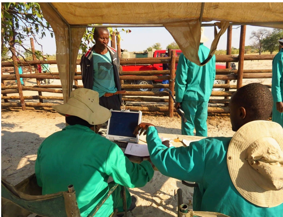
Fig. 4. Recordkeeping.

http://dx.doi.org/10.20506/bull.2020.2.3158