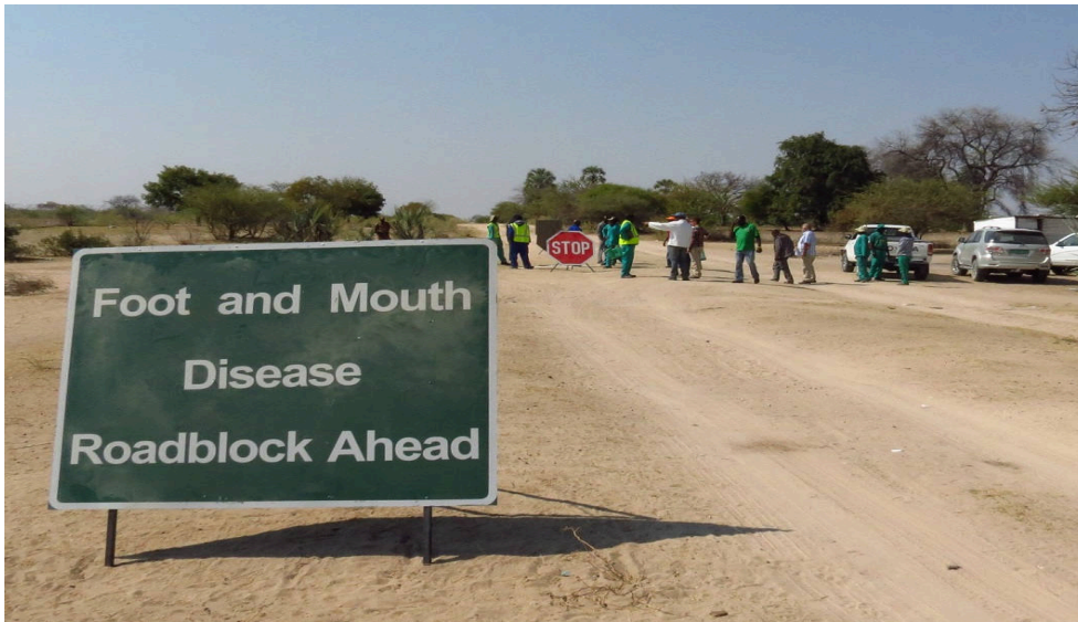
Fig. 2. Roadblock on the Namibia–Angola border.