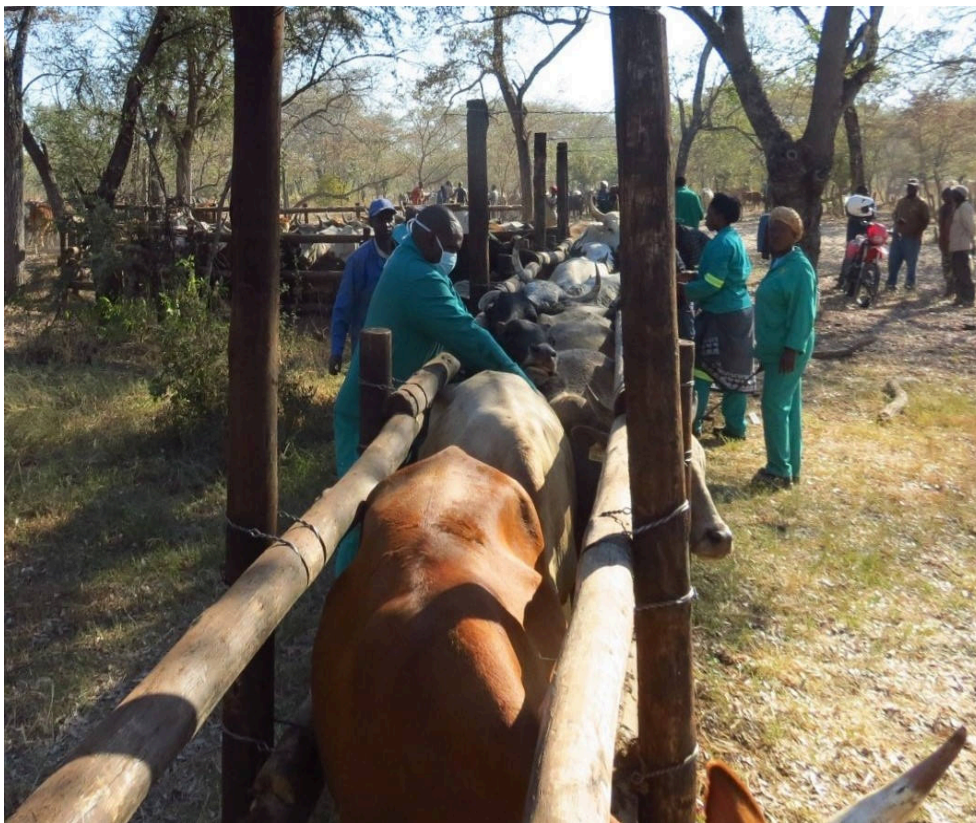
Fig. 3. Ring vaccination against FMD.