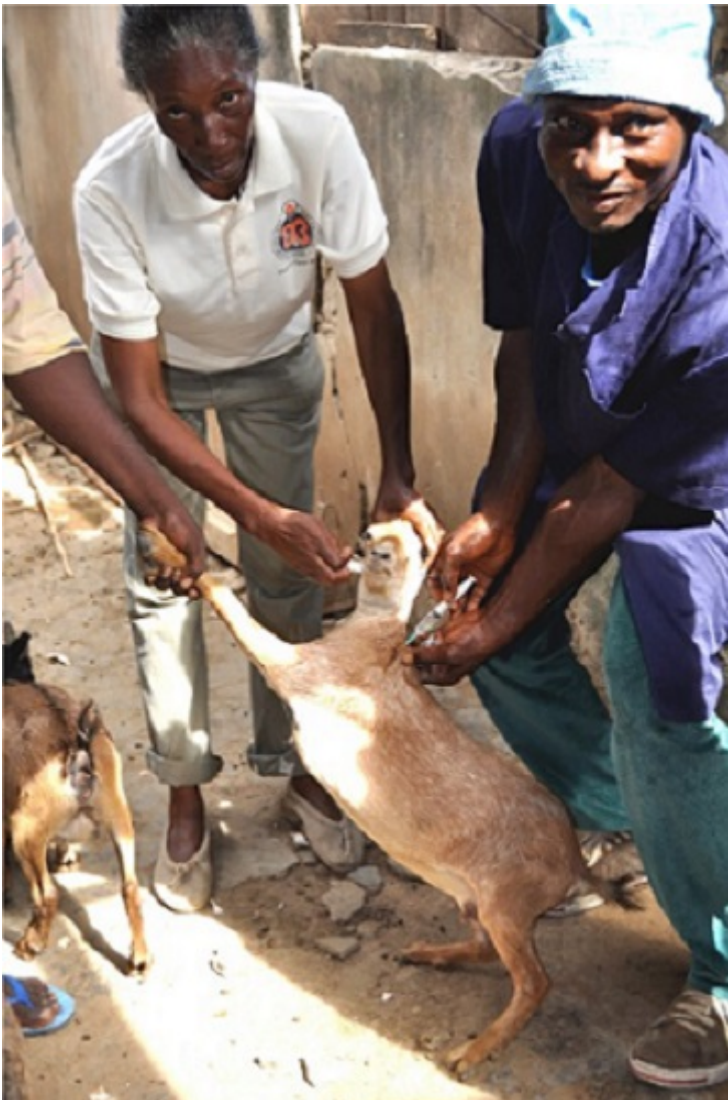
Vaccination of goats in a village in Ghana

The main benefits of the PPR Vaccine Bank demonstrated by the programme were the following: