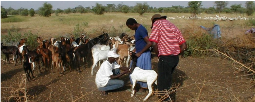
Vaccination of small ruminants in Burkina Faso

* Corresponding author: jemidomenech@gmail.com