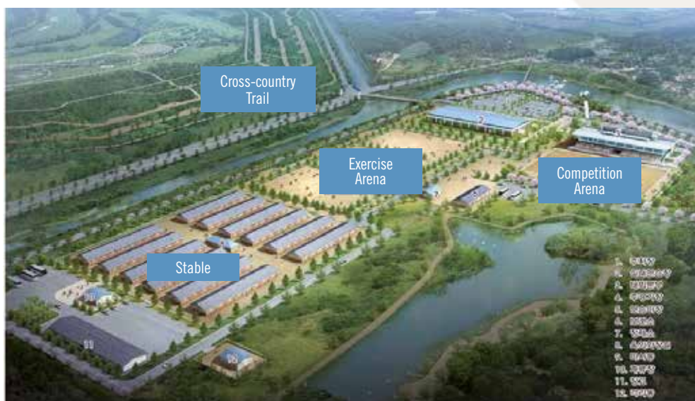
Fig. 2 Dream Park equestrian venue

All measures have been put in place to isolate the Dream Park equestrian event location from the rest of the country, including a surrounding surveillance zone. Passive and active surveillance have demonstrated the EDFZ to be free from the following diseases: African horse sickness, equine encephalomyelitis (all types), vesicular stomatitis, glanders, dourine, equine infectious anaemia, rabies, anthrax and Japanese encephalitis.