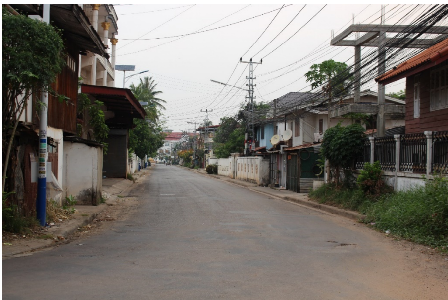
Empty roads under lockdown