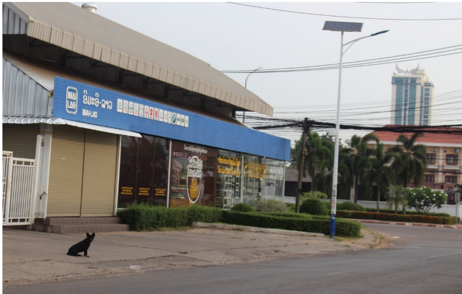
Dog near the car centre