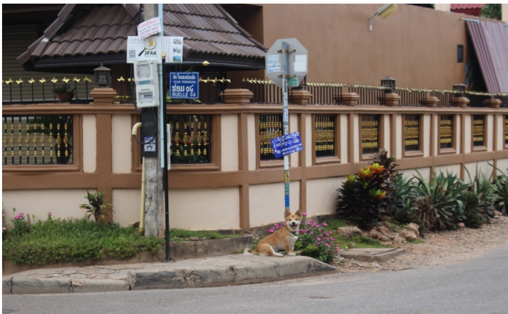
Dog at the corner of the road near my house