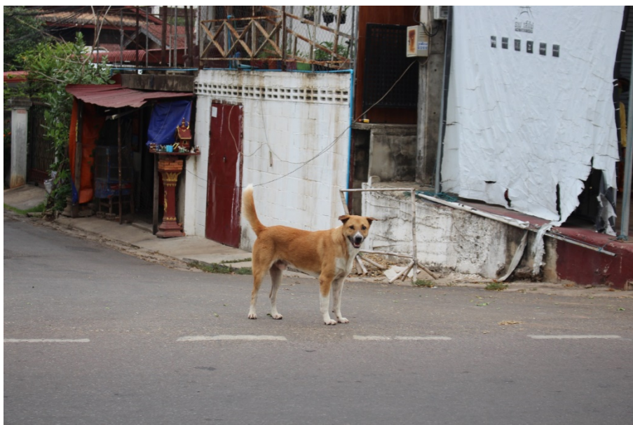
Dog nearby a lane