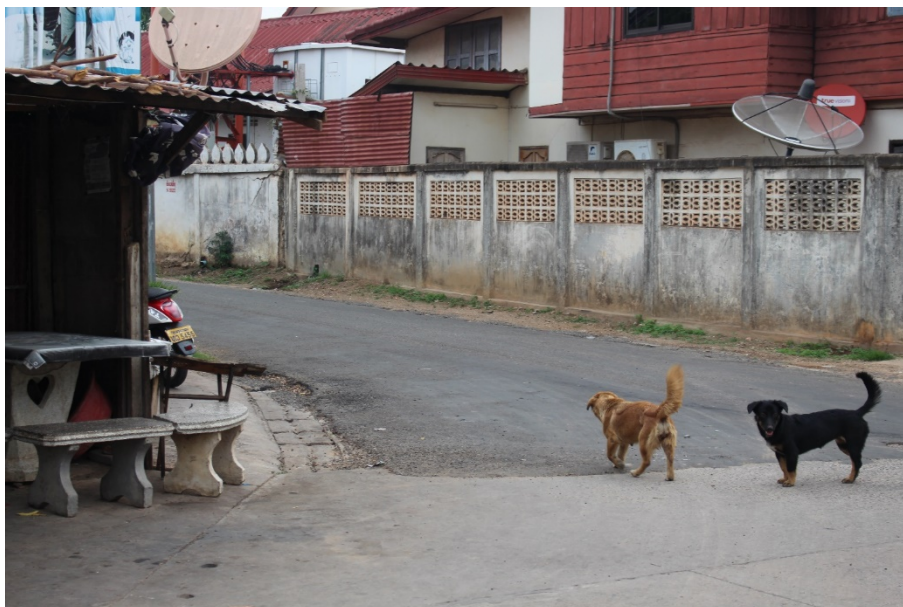
Dogs near a vegetable shop