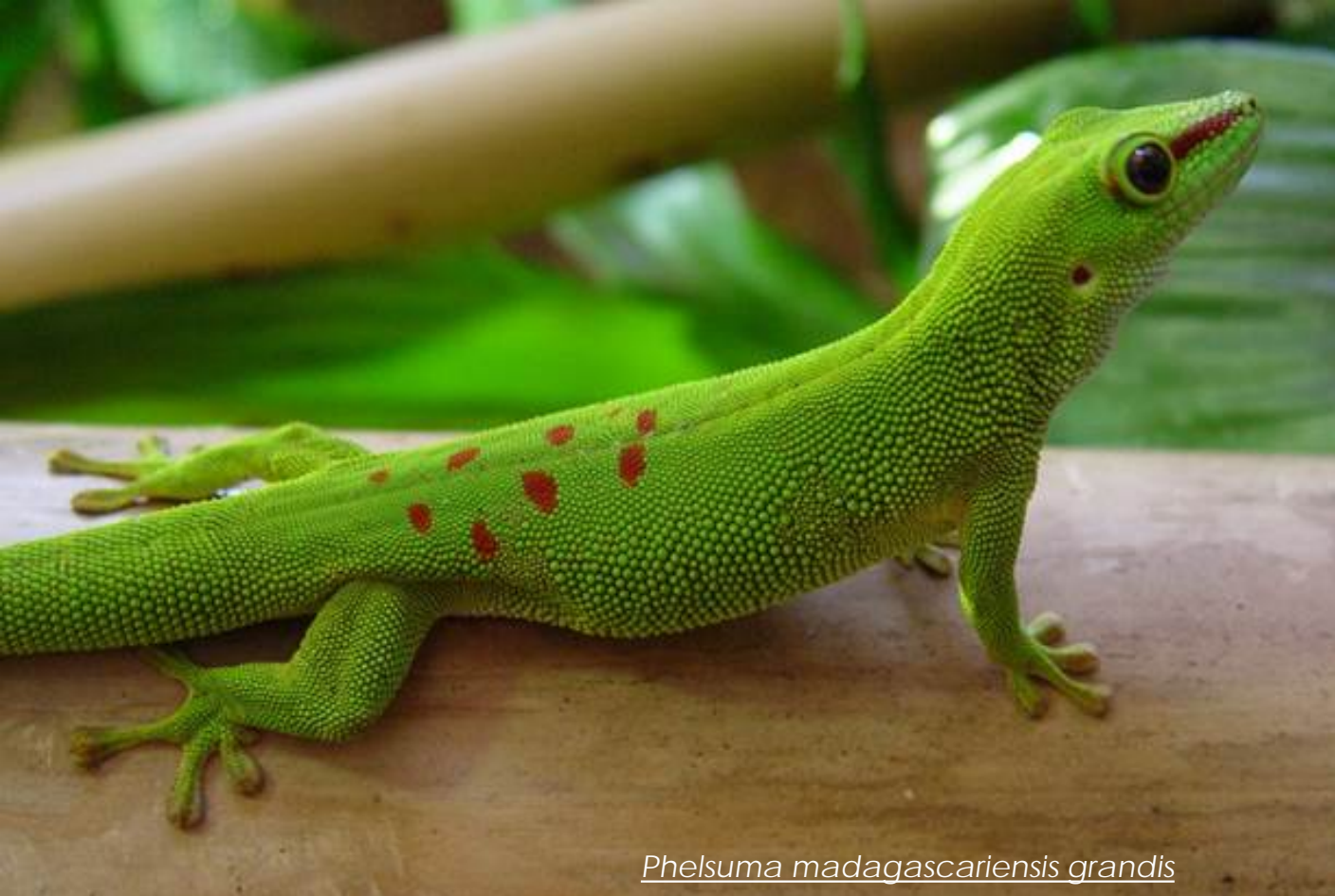
Phelsuma madagascariensis grandis