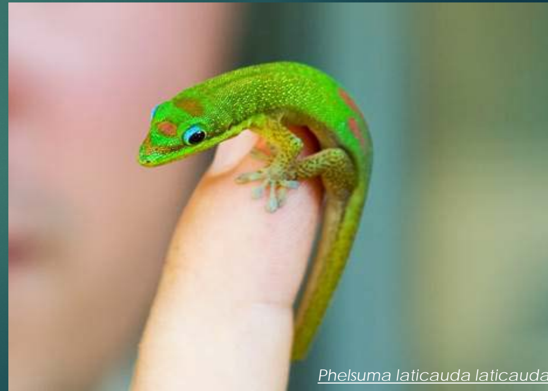
Phelsuma laticauda laticauda

I was breeding them for several years but unfortunately, I do not have my own pictures with me now. Here are a couple I found in Google. I am always available if any OIE colleagues need tips on how to take care of lizards, snakes or tortoises 😊.