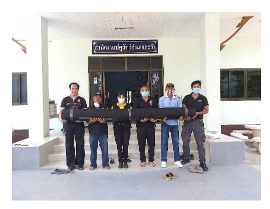
TEF donated nets to the DLD local office to distribute to horse owners.