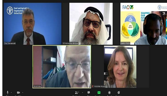
Meeting with the FAO-SNR office in Abu Dhabi