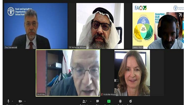
Meeting with the FAO-SNR office in Abu Dhabi