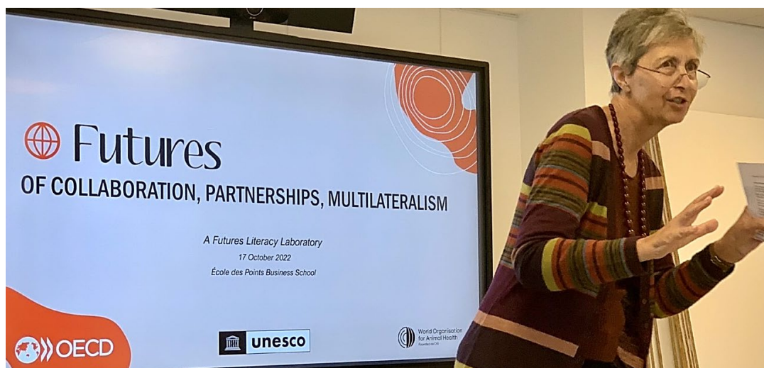
The DG providing opening remarks to participants of the second Futures Literacy Lab

Participants came up with several ideas and reflections to address how the Organisation might adapt or respond to today's climate crisis. For example, we should consider where to insert messages about environmental considerations while managing animal health and welfare. Or we could investigate and understand more about the nexus between animal health, greenhouse gas emissions and sustainable livelihoods. Additionally, we could work on establishing a corporate social responsibility strategy to reduce our carbon footprint, taking into consideration a travel policy, how we manage waste, including e-waste, and other environmental impacts of the Organisation's digital transformation.